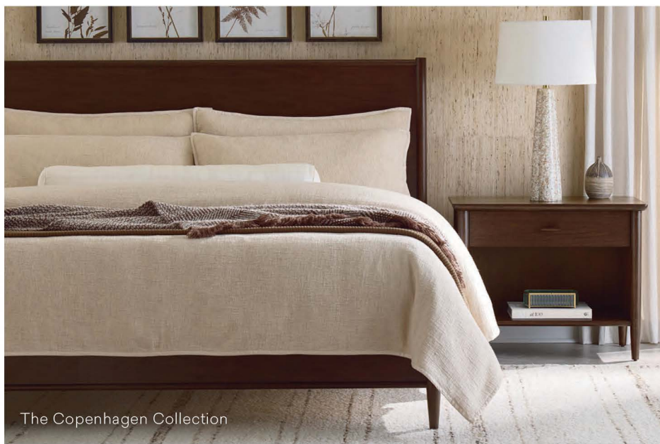
The Copenhagen Collection