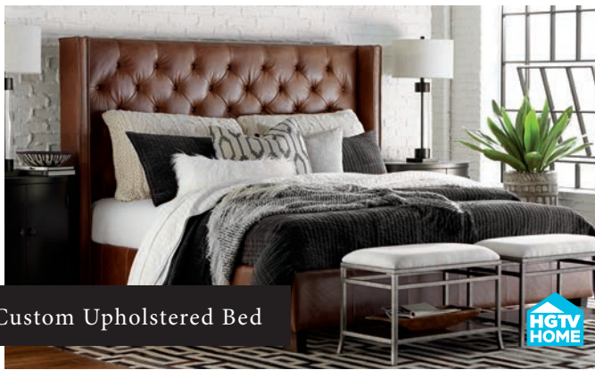
Custom Upholstered Bed