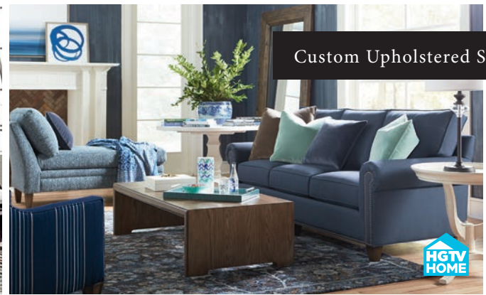
Custom Upholstered Sofa