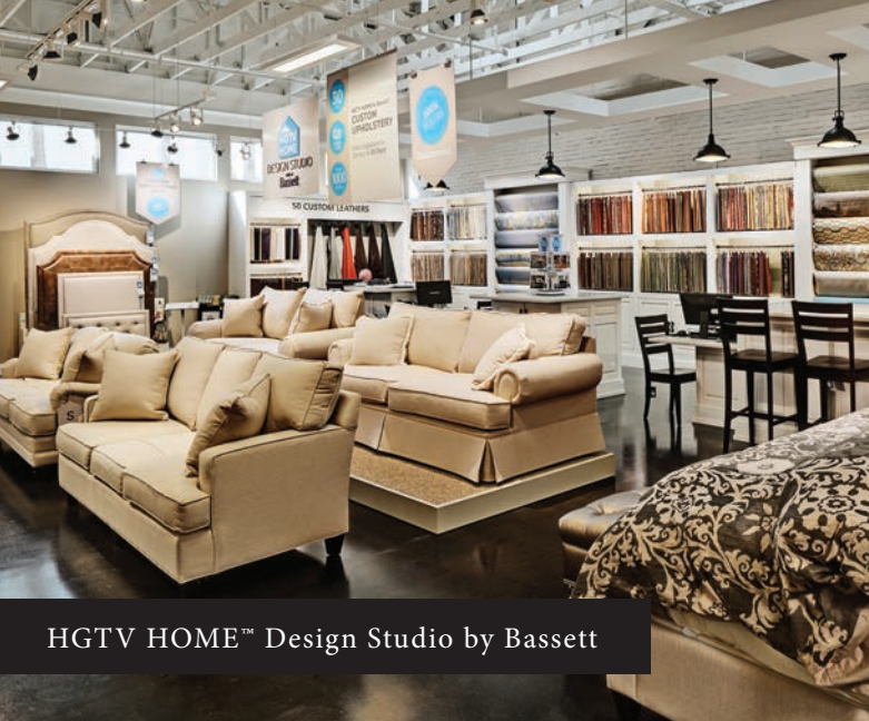
HGTV HOME™ Design Studio by Bassett